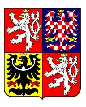
Czech State Emblem