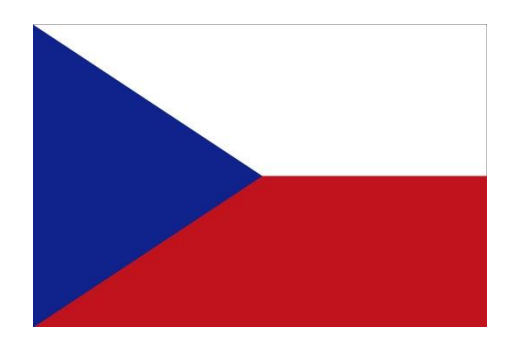
Flag of the Czech Republic