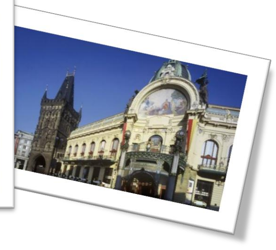
Prague is the top tourist destination in the Czech Republic. Recognized as one of the most beautiful capitals in the world, the city boasts an exquisitely preserved historical centre.