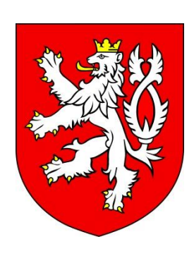
Small State Emblem