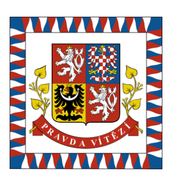
Flag of the President